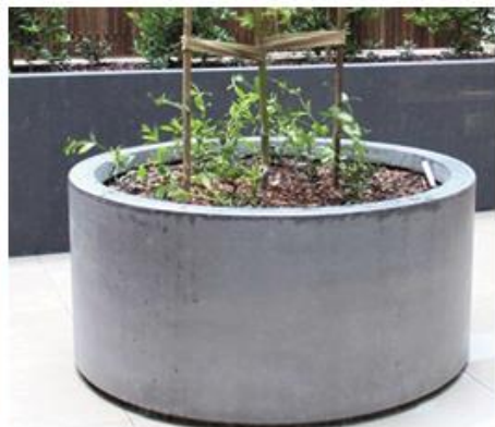
Raised concrete planter