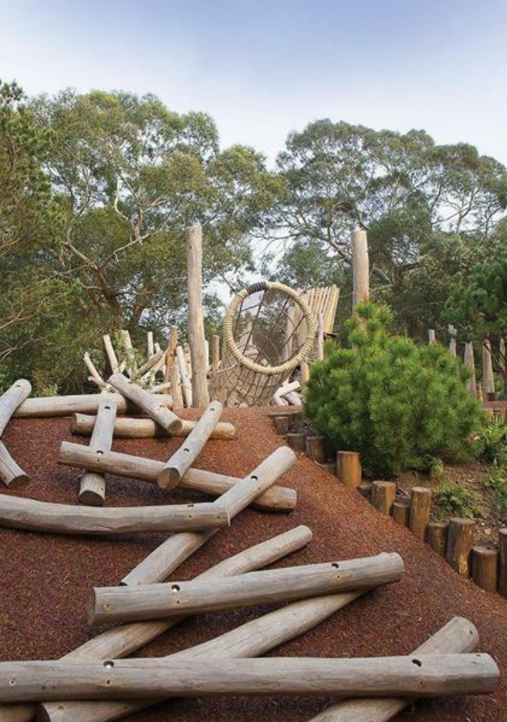
Log play fort