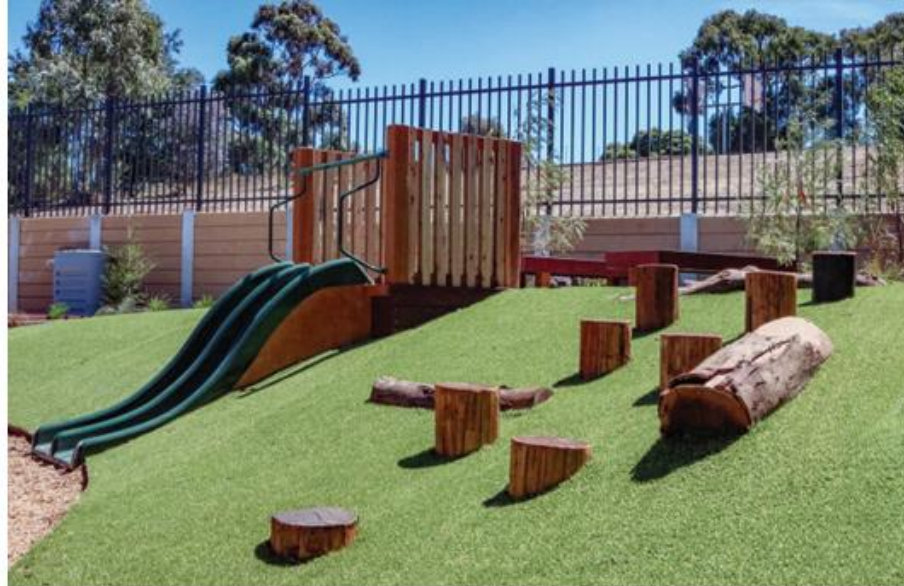
Raised sandstone and log garden bed