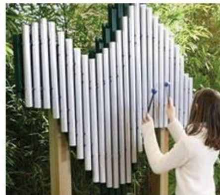
Music Play Panel