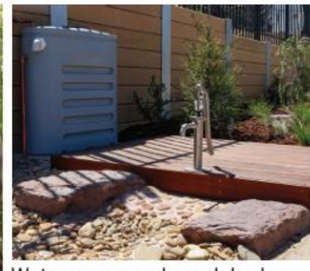
Water pump and creek bed